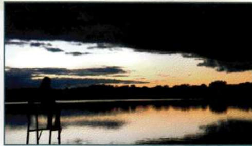
Calm sunset on Weaver Lake

The value of the Maple Grove lakes is not limited to those residing directly on the lakeshores. Living in Maple Grove offers you and your family easy access to participate in water activities such as boating, canoeing, fishing, skiing, swimming and anything else you could think of, on or around the water. The lakes in Maple Grove also offer a soothing, refreshing option to relax, catch a sunrise or soak in a quiet moonlight reflection. These lakes define the very personality of our city.