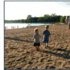
Summer day at the Fish Lake Regional Park beach

Fish Lake: Fish Lake is nearly 300 acres, over 60 feet deep and flows north into Rice Lake. A scenic lake, it is largely surrounded by natural and park land. The Timber Crest Forest Conservancy and Three River's Fish Lake Regional Park encompass the entire southern shoreline which is connected by trail system to Worden Park and several other city parks scattered around the lake. These parks contain over 12 miles of hiking, biking and walking trails—eventually connecting to the Medicine Lake Regional Trail to the south. Additionally these parks offer fishing piers, public boat access, dog off-leash area, swimming beach, volleyball courts, picnic areas and boat rentals. Fish Lake is good for catching panfish and is known to contain a solid largemouth bass population. It is also a popular place to troll for northern pike.