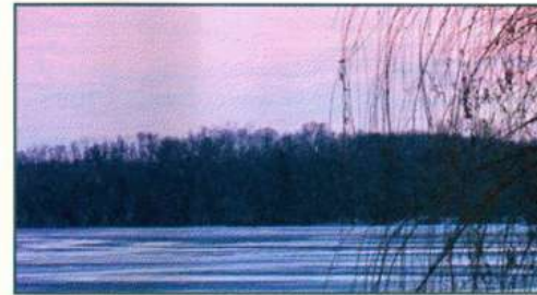
Beautiful scenery on creek side of Rice Lake

The City also sponsors the Lake Quality Commission which serves in a resident advisory role to the City Council and also facilitates fish and aquatic plant surveys to understand the long-term trends within our lakes. There are numerous measures in which the City is currently engaged in protecting and improving the water quality of the lakes including communication with lake associations, local area watersheds and applicable government entities such as the Minnesota Pollution Control Agency and the Department of Natural Resources.