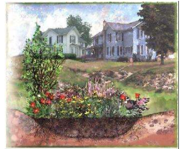
Planted 05/20/2003 on Detroit Lake in Becker County.